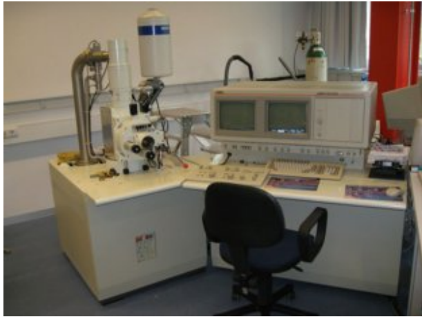
(Not Actual Picture)

The SEM can be used to examine surface details of solid materials. Internal surfaces can be exposed by sectioning or fracturing. It is equipped with a Evex EDS/EDX energy dispersive spectrometer which permits qualitative and quantitative compositional analysis. Image analysis software permits detection, measurement and analysis of features of interest; and elemental analysis establish the spatial position the elemental composition.