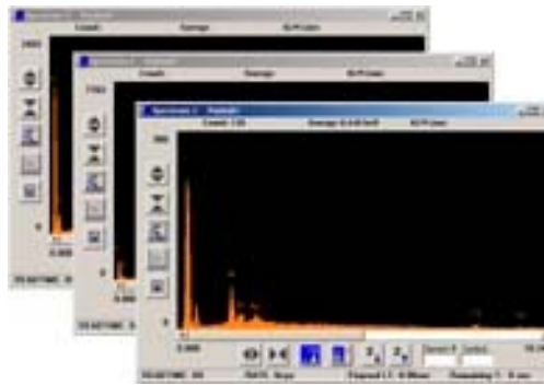
Image Processing Image Analysis Image Operations Image Filters Thermal Imaging Image Measurement / Annotation Easy Report Writing AutoSave